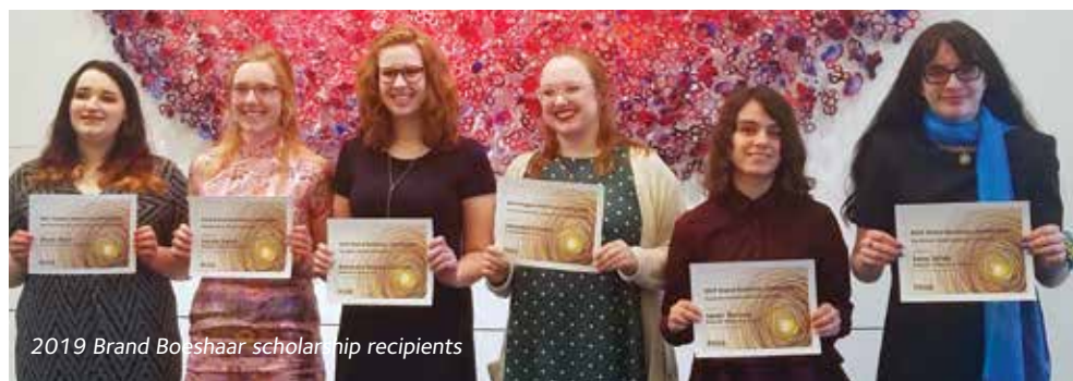
2019 Brand Boeshaar scholarship recipients