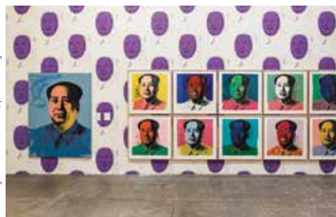
The Andy Warhol Museum, photo Abby Warhola

Help us continue to support you by supporting the museum through the annual fund. Your gift will help us continue to serve more than 100,000 people a year, provide educational outreach to more than 25,000 students and fulfill our mission to bring art and people together. To support the Figge by becoming a member, visit www.figgemuseum.org and click on "Join & Support."